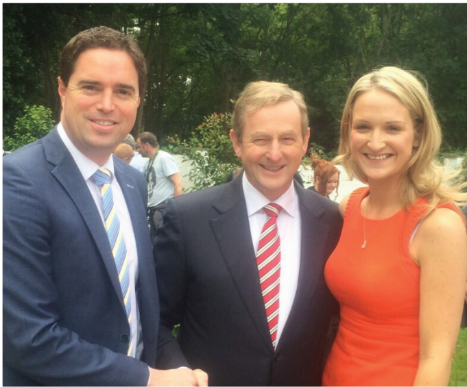
Pictured with Taoiseach Enda Kenny and Deputy Helen McEntee at the launch of our standing up for Rural Ireland Campaign.

There would be many benefits to such a scheme and I am continuing to fight for it.