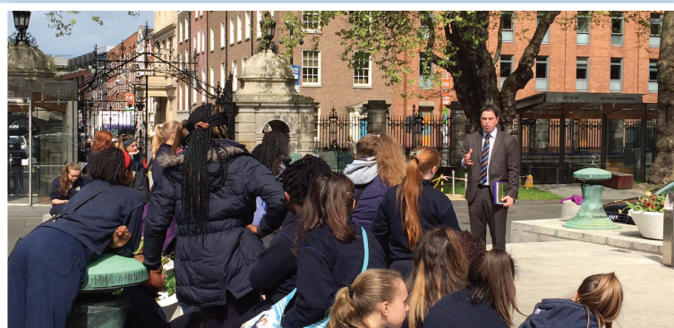
I'm pictured with pupils from Scoil Mhicil Naofa on a recent tour of Leinster House.