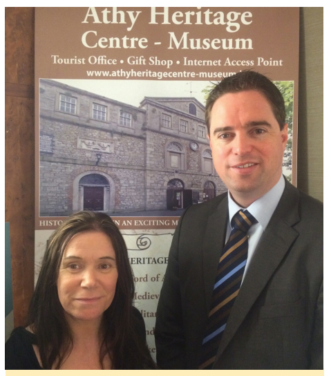
EXCITING PLANS FOR ATHY REGENERATION As chairman of the Friends of Athy Heritage Centre Museum I am very supportive of their continued development and exciting expansion plans which will help to put Athy on the map as a heritage town. I am also working with the Athy regeneration business sub committee on regeneration plans for the town. These exciting plans together with the purchase of the Dominicans site and the inclusion of Athy on the IDA's regional aid map should help to boost activity in the town, which is a priority of mine.

am pleased that the work to ensure an extension for Newbridge cemetery is almost complete. The extension will cater for the needs of the town for the next 20 years.