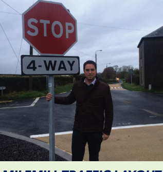
MILEMILL TRAFFIC LAYOUT This busy junction between Kilcullen and Ballymore has been a danger for years. I worked with Council officials to find a solution and am pleased to see the new four way stop junction now in place and working well.